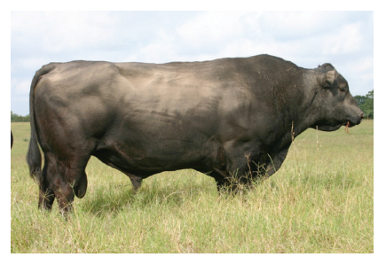
Bloodlines for Woodstone bulls go back to Wye and Craigie Angus breeding, with a slight infusion of American genetics to enhance marbling.