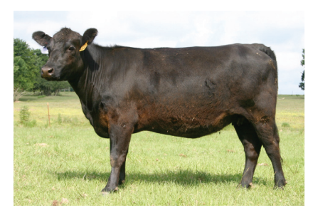
Woodstone Angus females are easy-keeping and fertile.