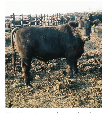
Woodstone steers produce consistently high Quality and Yield grade beef, even though their looks – small stature — can be deceiving.

Apparently, they were warmly received by the Irish cattle producers. "You cannot meet a stranger," he laughs. They traveled during the summer months and discovered the long daylength Ireland enjoys at that time of the year. "It doesn't get dark until after midnight over there. We stopped at a gas station at 3:30 in the morning to get some 'petrol' and we went in and had a